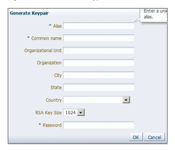
Figure 31–3 Generate Keypair