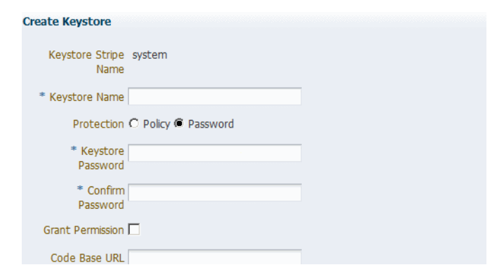
Figure 31-1 Create Keystore