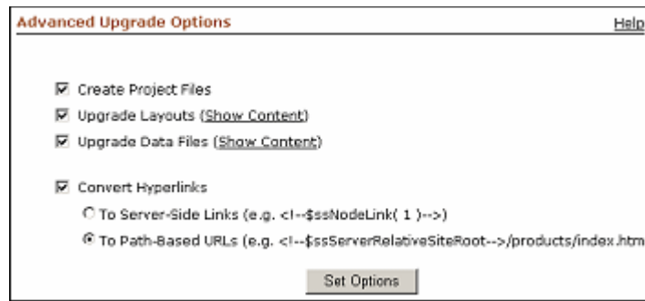
Figure B–2 Advanced Upgrade Options Screen