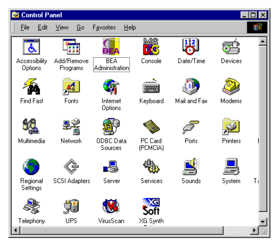
Figure 2-1 Microsoft Windows Control Panel

1. Choose Start \rightarrow Settings \rightarrow Control Panel to launch the Control Panel.