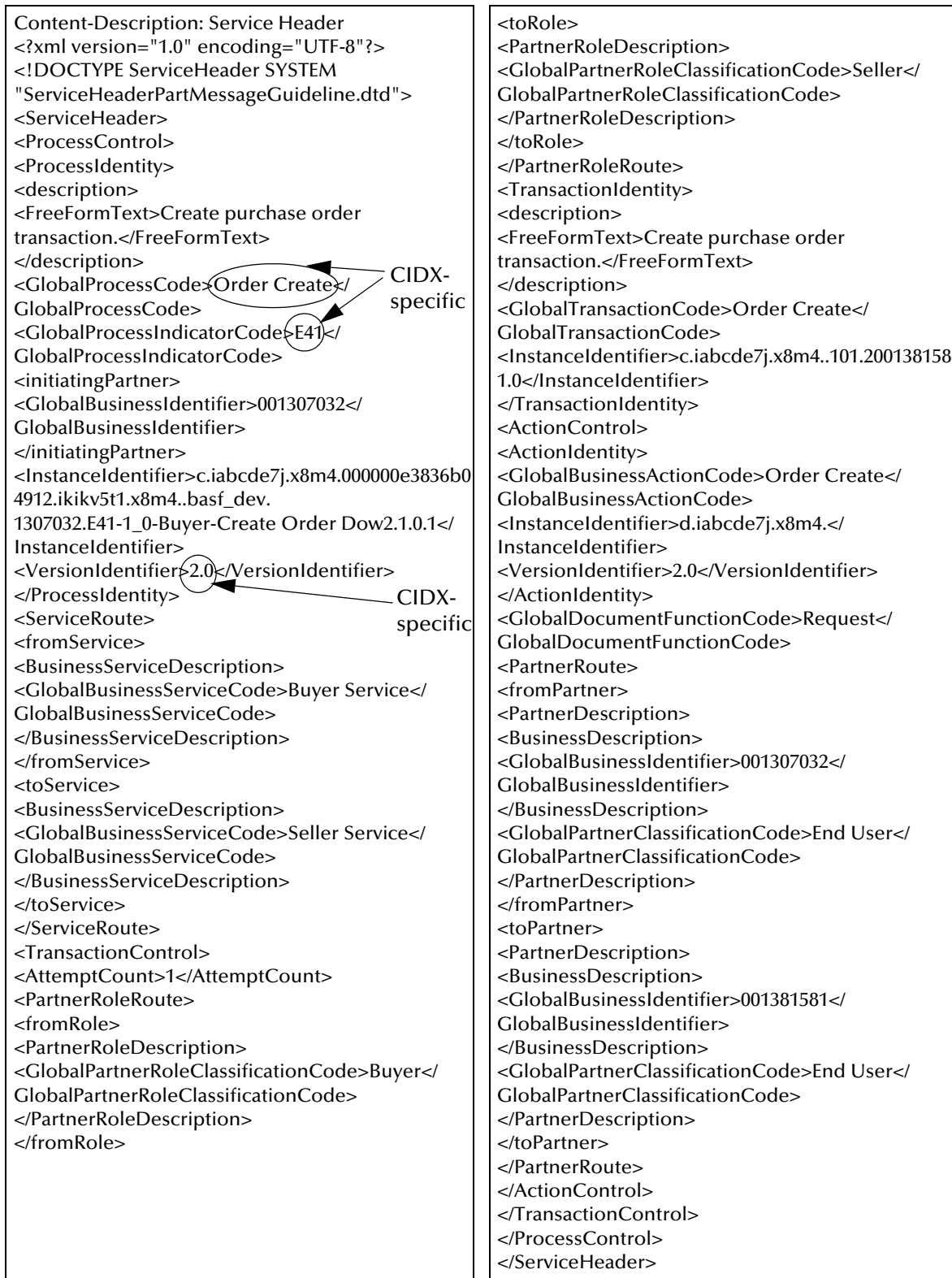
Figure 3 Example of a CIDX Service Header (shown in two columns)