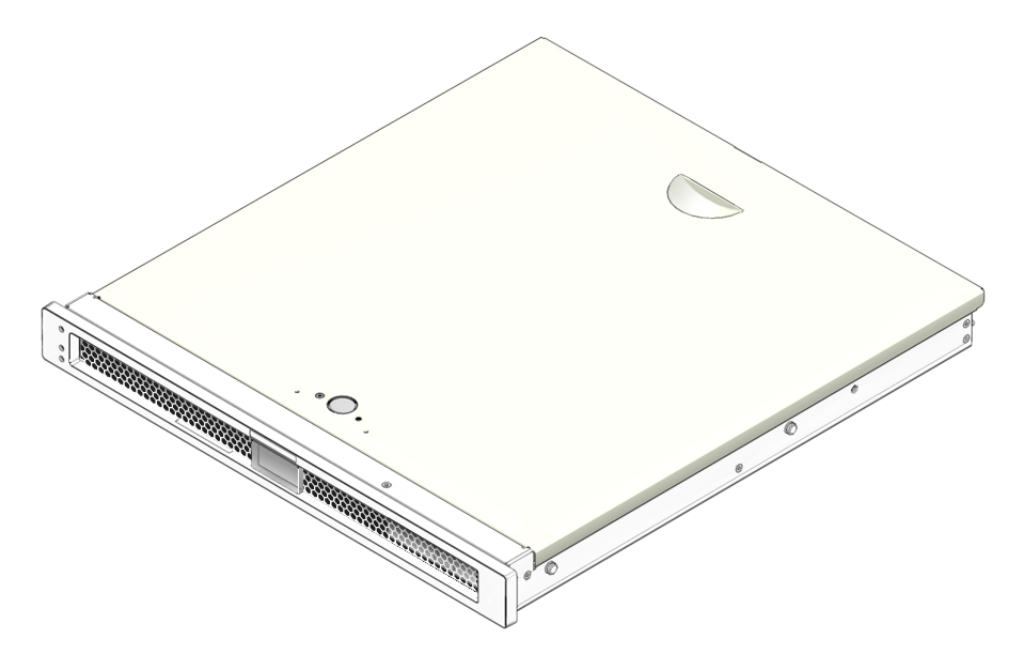
FIGURE 1 Sun Fire T1000 Server