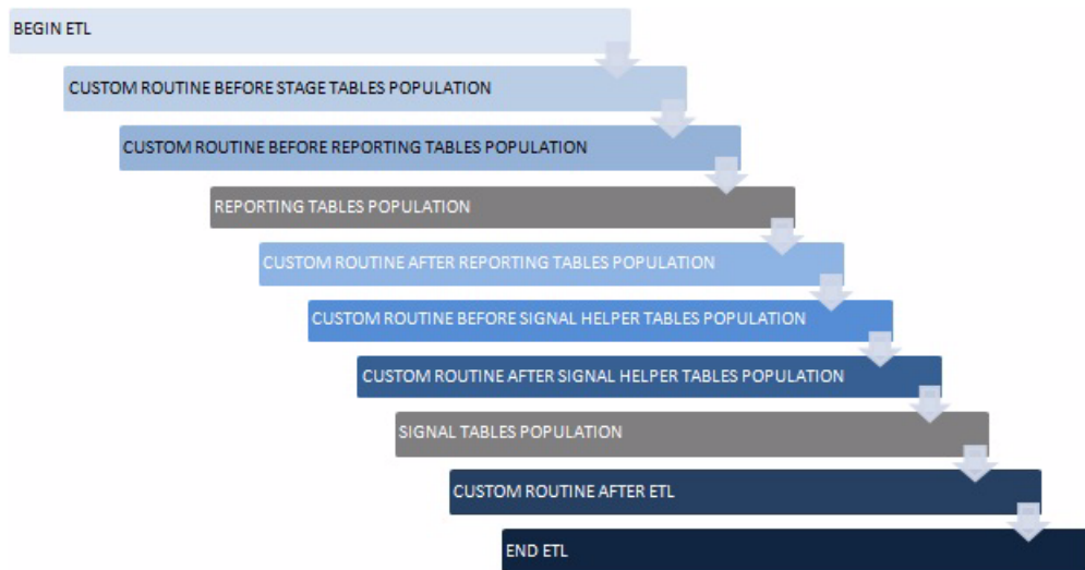
Figure 2–3 Sequence of ETL Hook Execution

Follow the steps given below to execute an ETL Hook: