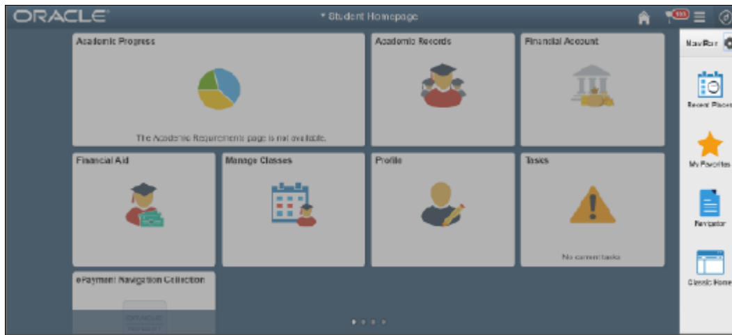
NavBar side page