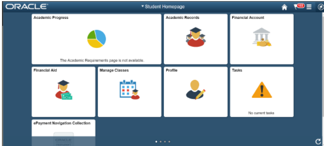
PeopleSoft Fluid User Interface home page

The Navigation bar (NavBar) side page appears.