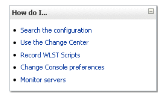
Figure 2-3 How do I...

This panel includes links to online help tasks that are relevant to the current Console page.