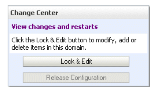
Figure 2–1 Change Center

This is the starting point for using the Administration Console to make changes in WebLogic Server. See Section 2.3.4, "Using the Change Center."