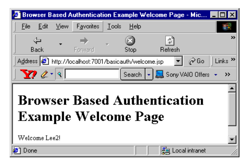
Figure 3-3 Welcome Screen