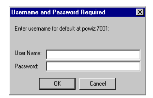
Figure 3-2 Authentication Login Screen

Note: See "Understanding BASIC Authentication with Unsecured Resources" on page 3-14 for important information about how unsecured resources are handled.