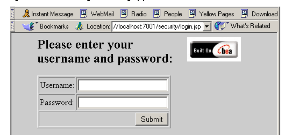
Figure 3-4 Form-Based Login Screen (login.jsp)