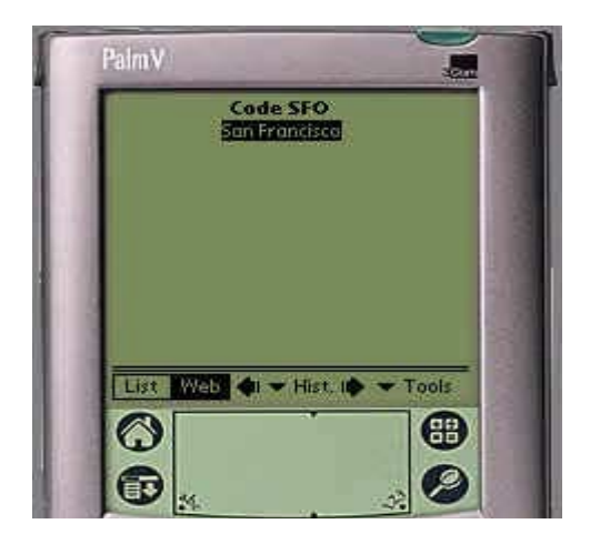
Figure 6–3 Output of AirportDefinition as seen on the HTML browser of a personal digital assistant.