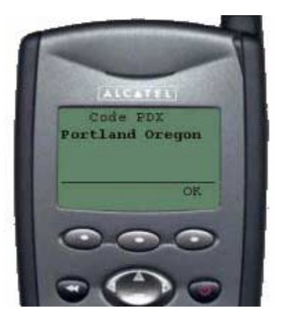
Figure 6–2 Output of AirportDefinition as seen on a cellphone