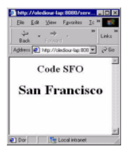
Figure 6–1 Output of AirportDefinition as seen on a desktop HTML Browser