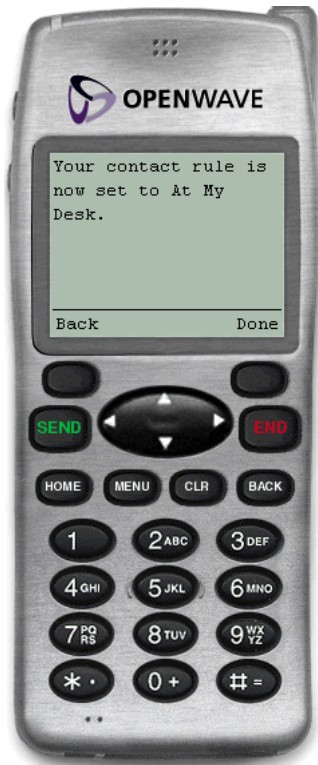
Figure 4 The Confirmation Page (from a Device)