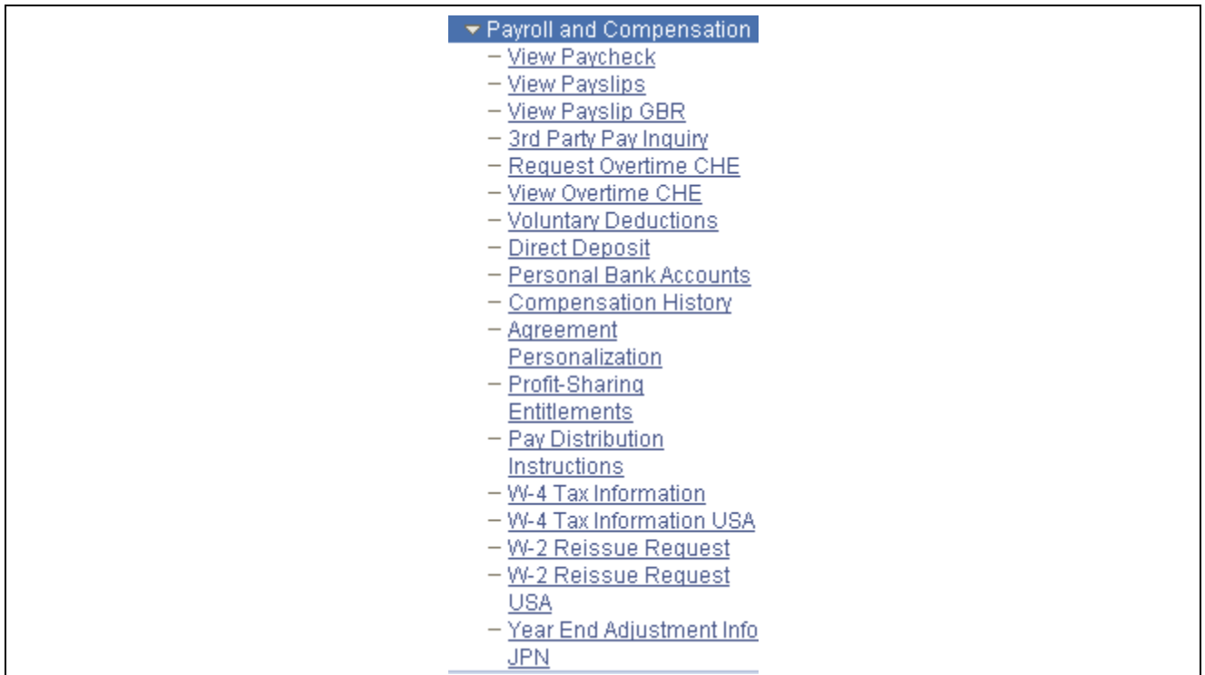
Standard navigation path