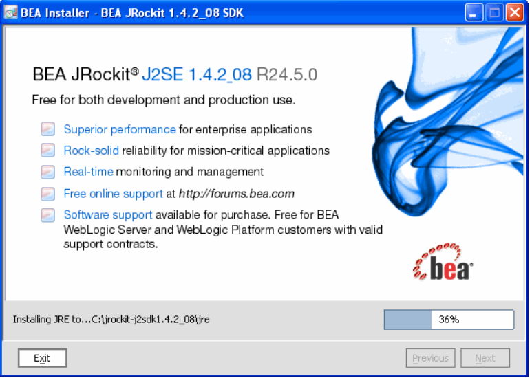
Figure 1-3 Install Splash Screen with Progress Meter

When the installation is complete, the Installation Complete screen appears.