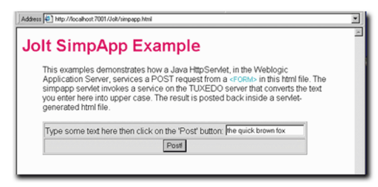
Figure B-1 simpapp.html Example

If you have problems displaying the form, be sure that the simpapp.html file is in the WebLogic document root.