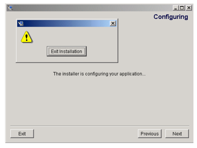
Figure 3 Warning Message During Installation

If you see this message, click Exit Installation and install WebLogic Server. You can obtain the necessary files from the WebLogic Server support site.