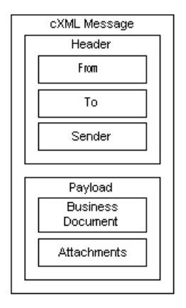
Figure 3-1 cXML Message Architecture

The message data structures are as follows: