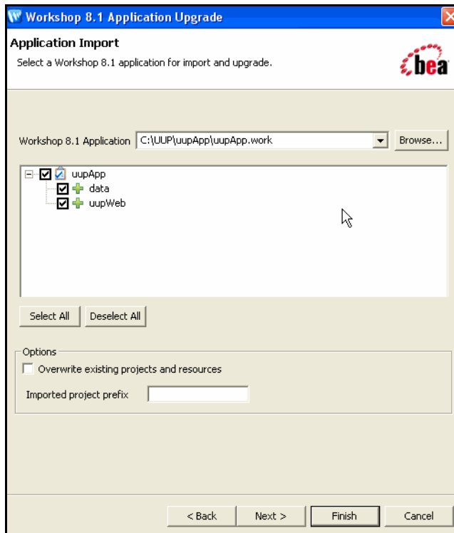
Figure A-1 Locate the 8.1 UUP Application