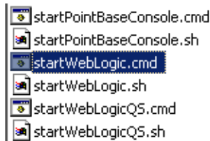
Figure 1 startWebLogic Script

Both of these start methods launch a command window and automatically begin the process to start the server. The server is running successfully when you see the RUNNING mode message in the command window.