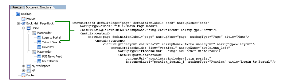
Figure 3 Hierarchical structure of a portal desktop

Notice that the XML contains configuration attributes for the portal elements.