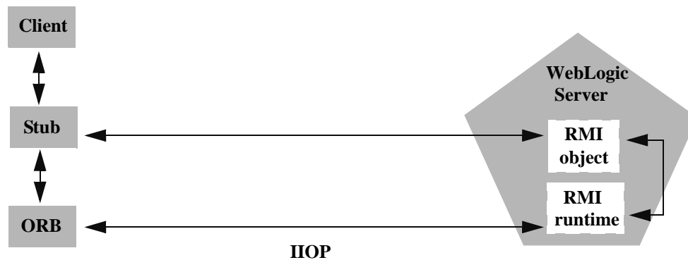
Figure 7-1 RMI Object Relationships

Figure 7-1 shows RMI Object Relationships for objects that use IIOP.