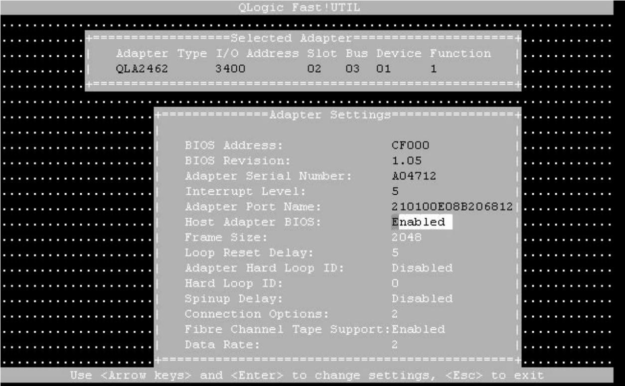
FIGURE 8-4 HBA BIOS Screen for an HBA WWN