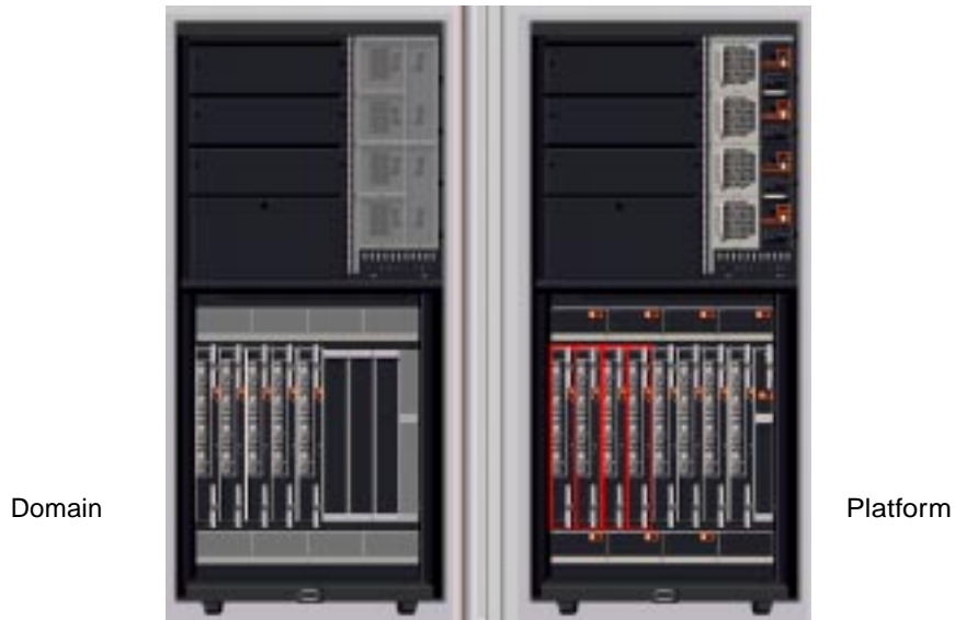
FIGURE 5-3 Physical Views of a Starfire Domain and a Starfire Platform

Note – Display the Starfire platform physical view if you want more information about the entire platform.