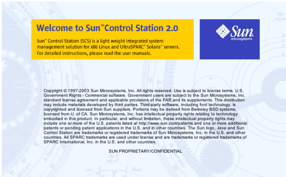
FIGURE 2 Main splash page