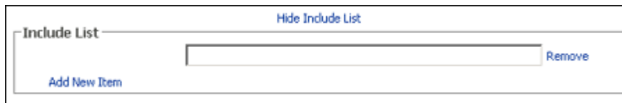
Figure A-8 Include List Section

If you list a URL for inclusion in this section, and it appears in a listed FilterSet type 'exclude', then it will not be included in the publishing.