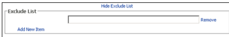
Figure A-9 Exclude List Section

The Exclude List is used to specify which parts of the site (by URL) should be excluded from publishing.