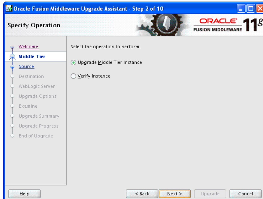
Figure 4–2 Upgrade Assistant Select Operation Screen for an Oracle Forms and Reports Upgrade

The options available in the Upgrade Assistant are specific to the Oracle home from which it started. For example, when you start Upgrade Assistant from an Oracle Forms and Reports Oracle home, the options shown on the Specify Operation screen are the valid options for an Oracle Forms and Reports Oracle home.