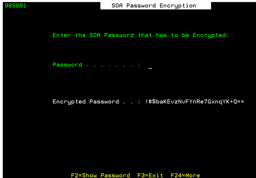
Figure 4–2 Encrypted Password

Note: You cannot leave the Password field blank.