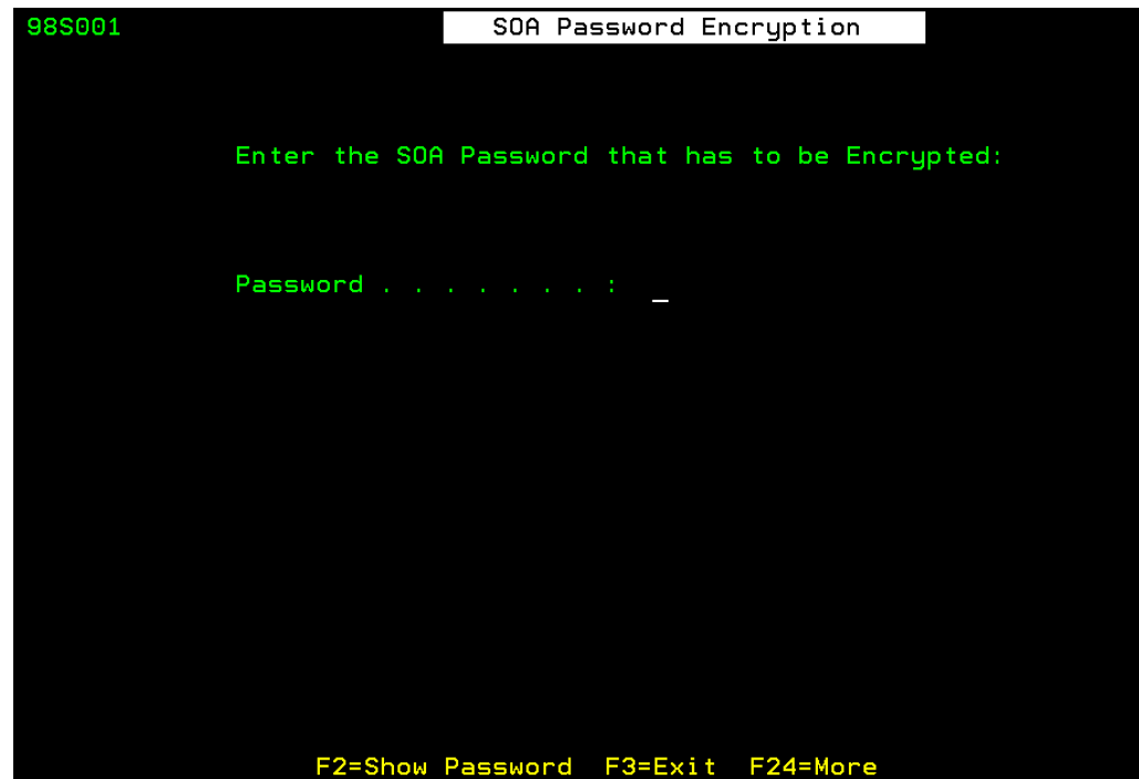
Figure 4–1 SOA Password Encryption