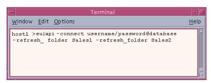
Figure 1–2 Using the Discoverer EUL Command Line for Java from a UNIX command prompt