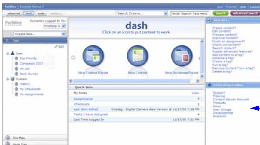
Figure 2: Customizing Links in the “Learn About FatWire” Pane

learnmorelink properties are used to create links to URLs