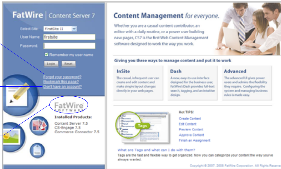
Figure 4: Content Server's Dash Interface

image is specified by clientlogo property