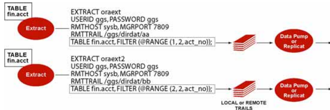
Figure 3 Dividing rows of a table between two Extract groups

It might be more efficient to use Extract to calculate the ranges than to use Replicat. To calculate ranges, Replicat must filter through the entire trail to find data that meets the range specification. However, your business case should determine where this filtering is performed.