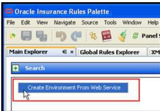
Rules Palette Right-Click Menu Option for Environment Creation

The environment creation wizard screen appears.