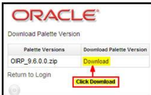
Web Application Utility Download link

Note: You do not need to enter a user name and password.