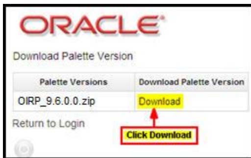
Web Application Utility Download link

Note: You do not need to enter a user name and password.