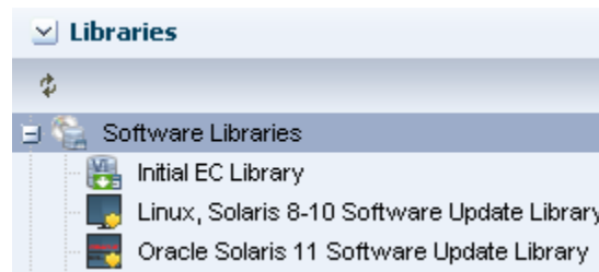
Figure 1 Software Libraries

Software libraries store the operating system images for provisioning, branded images, Flash Archives (FLARs), firmware, profiles, operating system updates, custom programs and scripts. Figure 1 shows the possible types of software libraries that are created when you install and configure Oracle Enterprise Manager Ops Center.