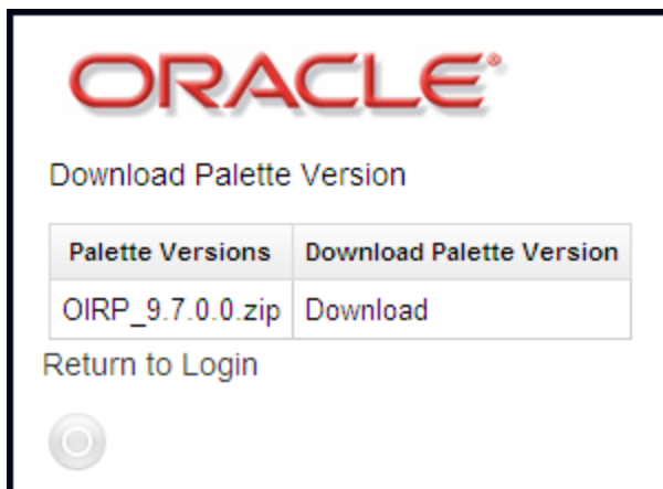
Web Application Utility Download list