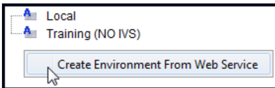
Rules Palette Right-Click Menu Option for Environment Creation

The environment creation wizard screen appears.