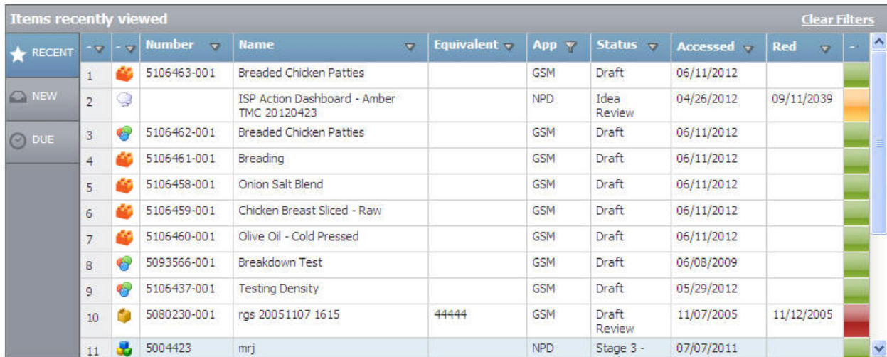
Figure 4. App Column with filter

When there are one or more filters selected on the grid, the Clear Filters link appears. Click Clear Filters to remove all filters from that grid.