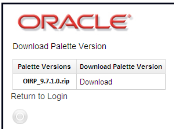
Web Application Utility Download list