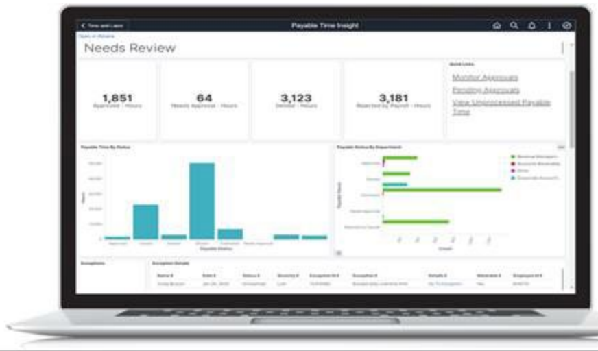
Figure 2. Payable Time Insights dashboard.