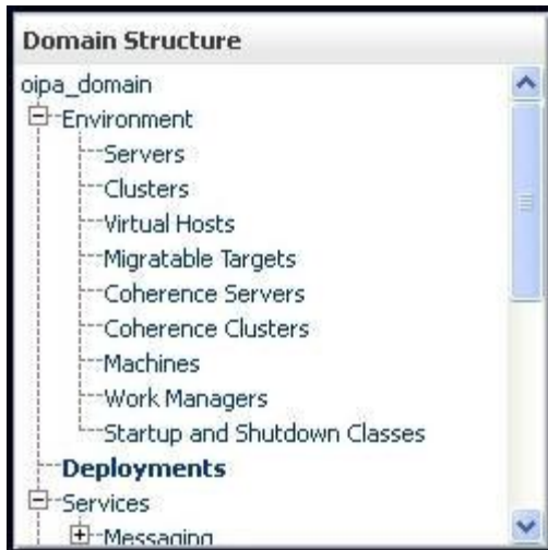
Deployments node within the WebLogic Domain Structure

To check cycle, ensure that run.sh (located in the /usr/oipa/OIPA_Home/CycleClient/bin/ folder) executes successfully from the cycle client.