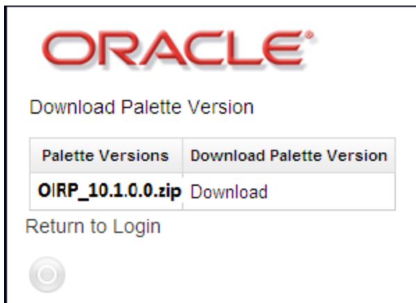
Web Application Utility Download list