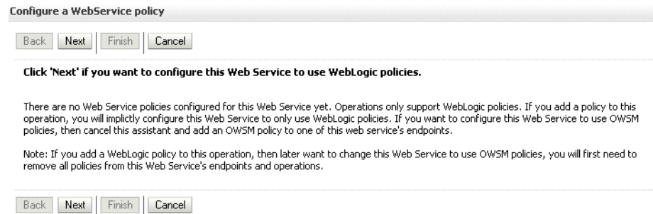
Figure A-3 WebLogic Server Policy Page