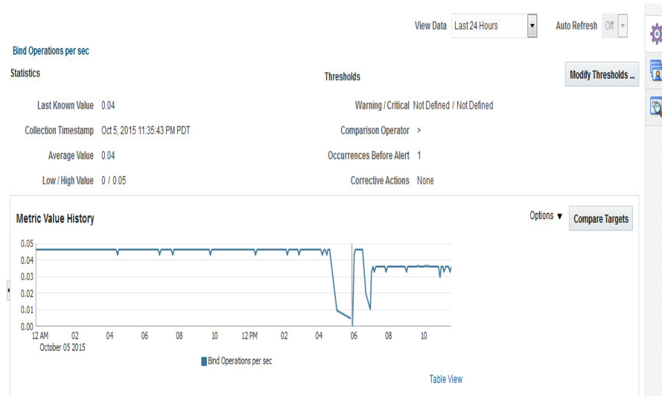
Figure 1–3 One Level Search Operations Per Second page

The All Metrics page enables you to specify how you want to view a particular metric. The All Metrics page also provides the ability to compare the metrics against to target instances. Use the View Data field to select a specific time Period for which to display the monitored data. Time Periods for seven days or more also display the minimum, maximum and average values of a metric during that Period.