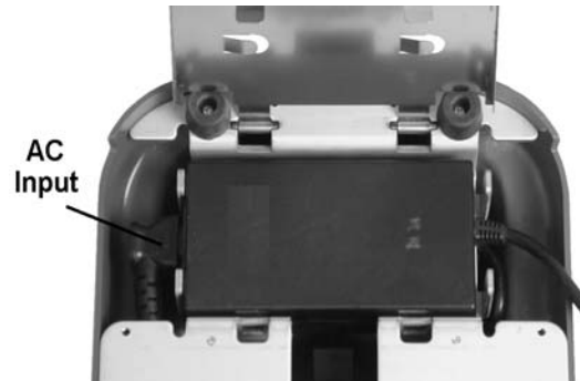
Figure 1: Installing the Optional Printer Power Supply