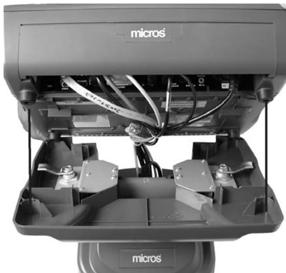
Figure 3: Placing the Workstation 5 on the Stand