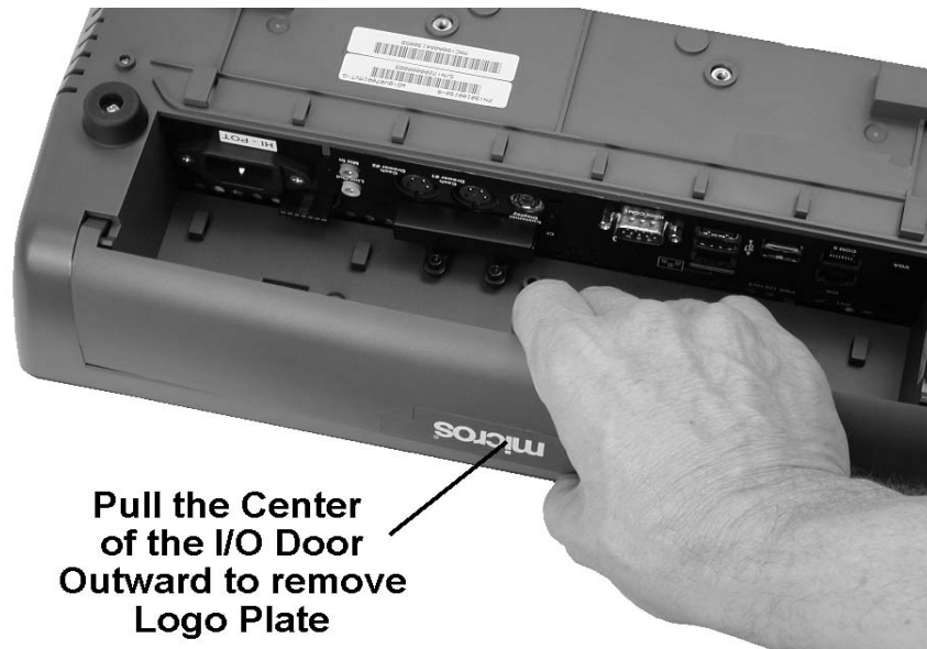
Figure 1: Remove the IO Door Logo Plate