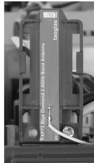
Figure 2: Install the Antenna Bracket