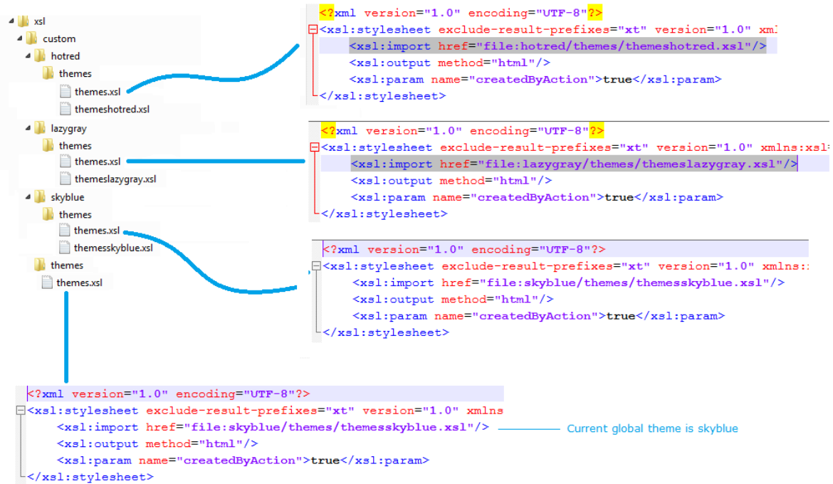
Figure 4-1: Example Theme XSL Structure