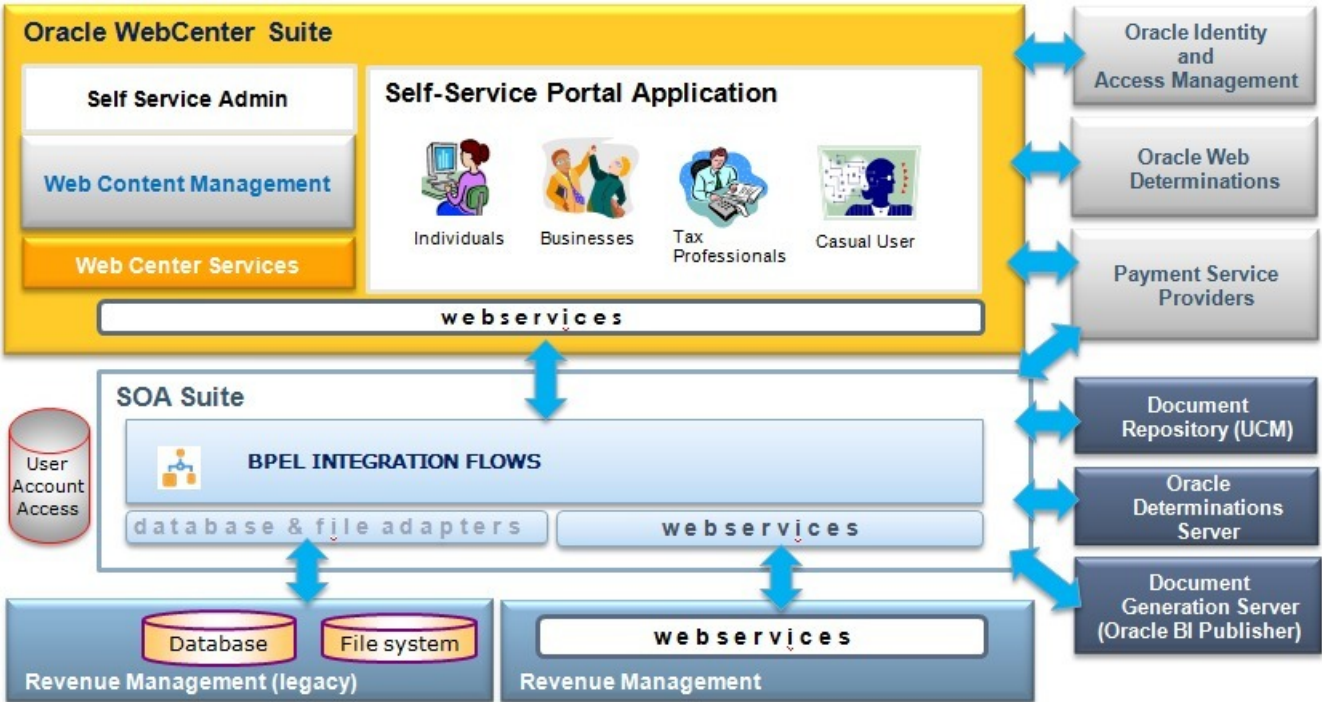
Figure 1: Technical architecture overview