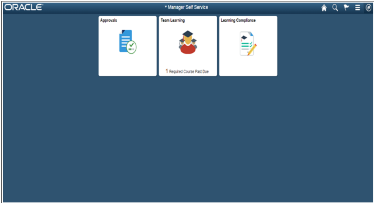
PeopleSoft Fluid User Interface home page

The Navigation bar (NavBar) side page appears.