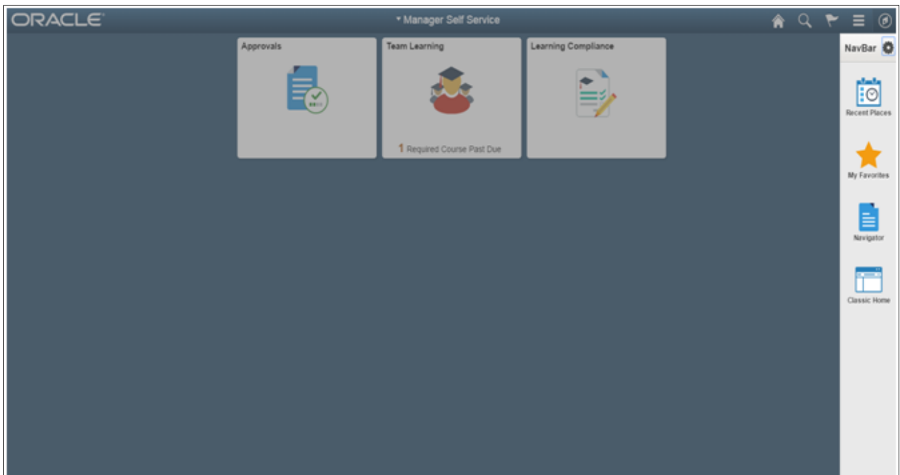
NavBar side page