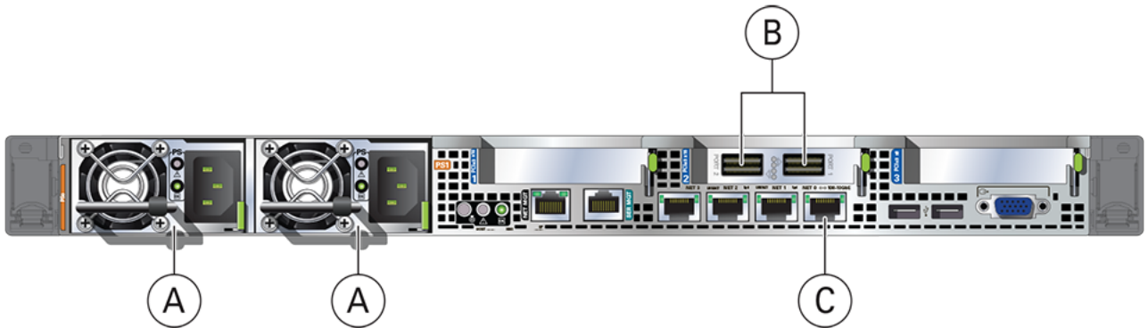
Table 5.1 Figure Legend