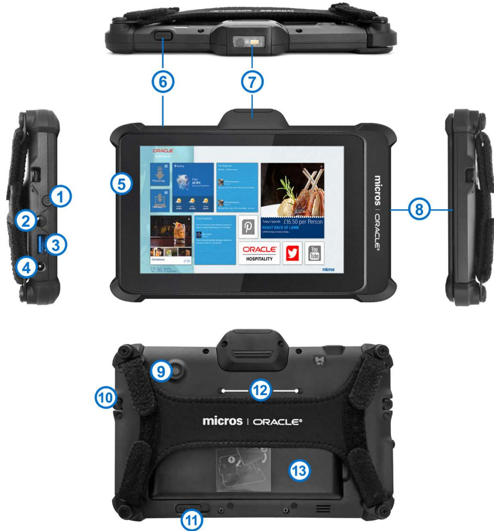
Table 2 Oracle MICROS Tablet 721P Basic Features