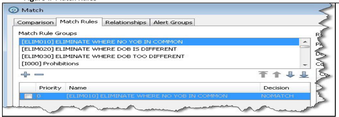
Figure 1: Match Rules

As each group is selected, the match rules it contains are displayed in the window below.