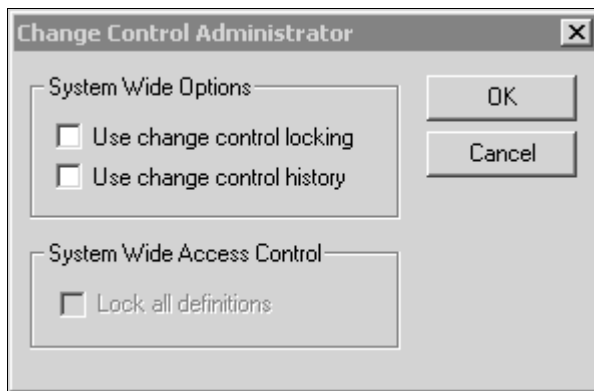
Change Control Administrator dialog box

The following example shows the options available on the Change Control Administrator dialog box: